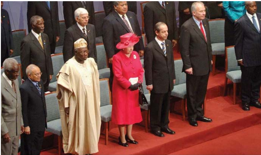
Malta's invitation to host CHOGM is partly due to the success of the 2005 summit held here - and the next Malta meeting could be the last opportunity to assure the Commonwealth's future.

Member of Commonwealth Host of CHOGM: 2005, 2015